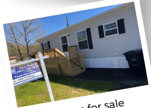
Homes for sale